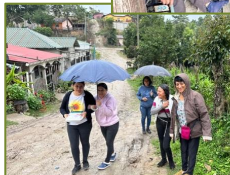
Left: It was a chilly rainy delivery day, but the smiles we received warmed our hearts.