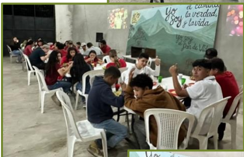
Left: Youth Group Christmas Party