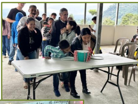
Right: Potrerillos Church Christmas Party

Our last Christmas party was for the congregation in Potrerillos. There we sang songs, had a message on the hope that Jesus brings, played games and ended the evening with a meal made up of a variety of grilled meats, rice and beans, and another Tres Leches cake!