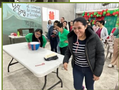
Right: Lady's Night Christmas Party in Corquín