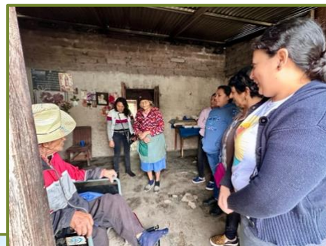
Right: The elderly man at one of the houses we visited has been unable to walk for years. His wife struggles to care for him but she thanks God for the life they have together.

This is just the beginning. Please keep these ladies in your prayers. They are an encouragement.